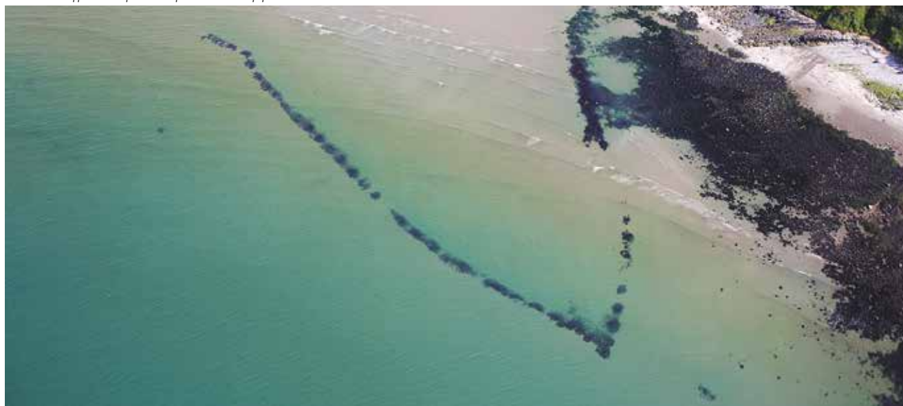
Ancient offshore fish traps near Poppit Sands, Pembrokeshire.

In particular, local planning authorities should make sure that information about heritage assets and the wider historic environment which is generated as part of the planning process is deposited into their HERs.